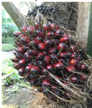
Grown with EtiMaden Boron