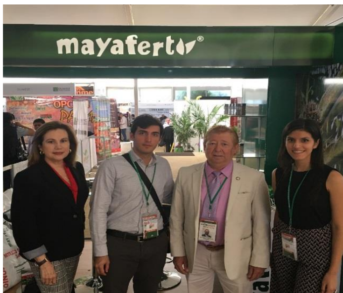
Mayafert – Leader in fertilizers/agricultural products – and preferred distributor for ETIGRAN in Guatemala