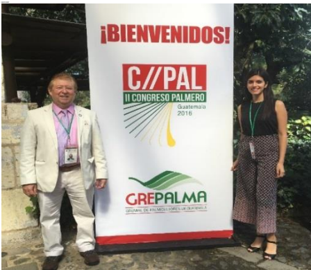
Etimine USA present at the II Oil Palm Congress C//PAL 2016, Guatemala