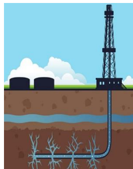
Eti Maden provides a large percentage of Ulexite utilized in fluids for the fracking industry

Agriculture Adhesives and Coatings Biocides—Pesticides Ceramics/Frits/Glazes Fire Retardants Glass/Specialty Glass Insulation/Fiberglass Metallurgy Oil & Gas Chemicals Wood Preservation And Many More!